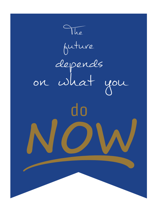
National Make a Difference to Children Month