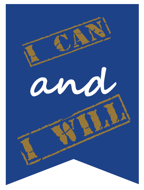
Older Americans Month Military Appreciation Month